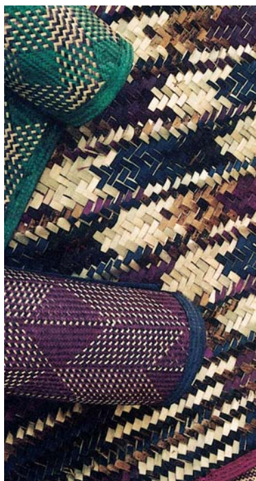
Women from Masaka use banana fibre to make mats (above) and baskets (right) that are sold in Kampala and other cities.