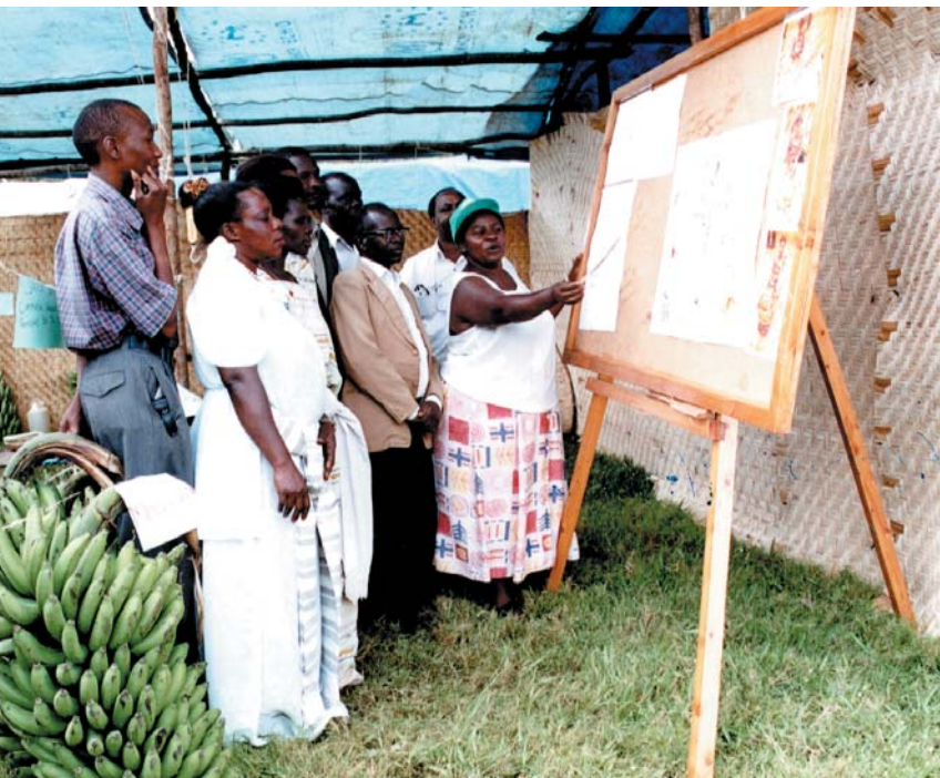
Farmers from Masaka discussing strategies to conserve their unique set of banana cultivars.

Some East African highland banana cultivars are peeled and put in a "banana boat" to make a beer rich in vitamin B.