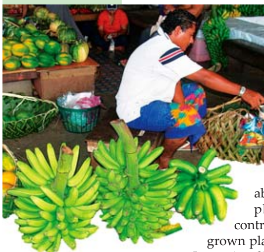
Goldfinger bunches (centre and left; Fa'i Samoa at right) in an Apia market, December 2004