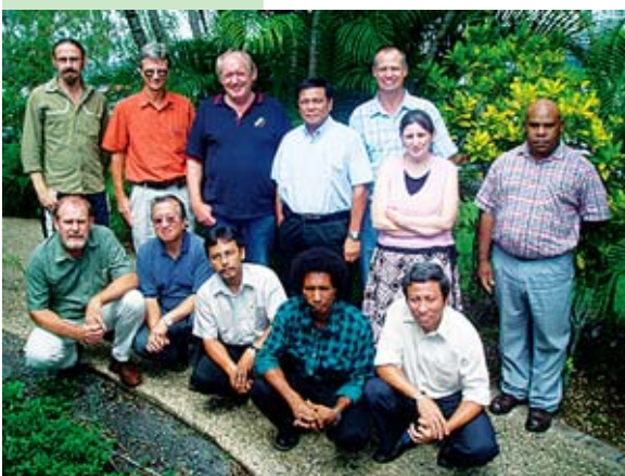
The Fusarium planning workshop participants