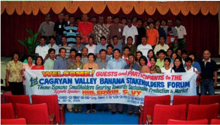
Participants of the 1st Cagayan Valley Banana Stakeholders' Forum held at the Isabela State University, Philippines

In the northern Philippines' Cagayan Valley, banana is widely grown as a cash crop and is the main source of income for thousands of mostly small-scale farmers. The main cultivars grown include Lakatan, Latundan, Bungulan and Saba/ Cardaba, primarily for the domestic market. However, several diseases, particularly the Banana Bunchy Top Disease (BBTD), practically decimated most of these small-scale banana farms. Banana production in the region dramatically declined to almost nil. Presently, only a handful of banana farms remain. Banana stakeholders in the region agree that a massive rehabilitation programme is needed to revive the industry. In response, INIBAP initiated a collaborative project with the Quirino State College to promote the use of tissue cultured banana planting materials and annual cropping of banana in the region. To kickstart the rehabilitation programme, INIBAP also helped organize the 1st Cagayan Valley Banana Stakeholders' Forum, which was held at the Isabela State University from 30 to 31 March 2006.